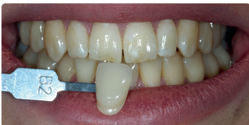
Before Boutique Whitening