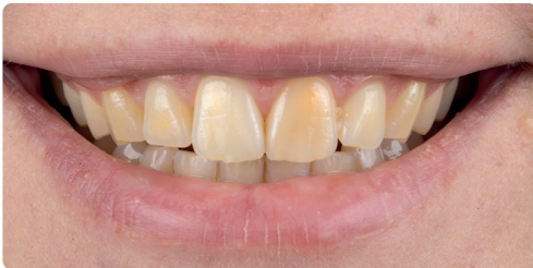
Before Boutique Whitening