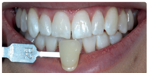
After Boutique Whitening